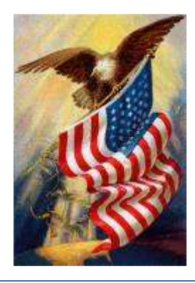
"In our waiting and hoping—prayer deepens our roots."